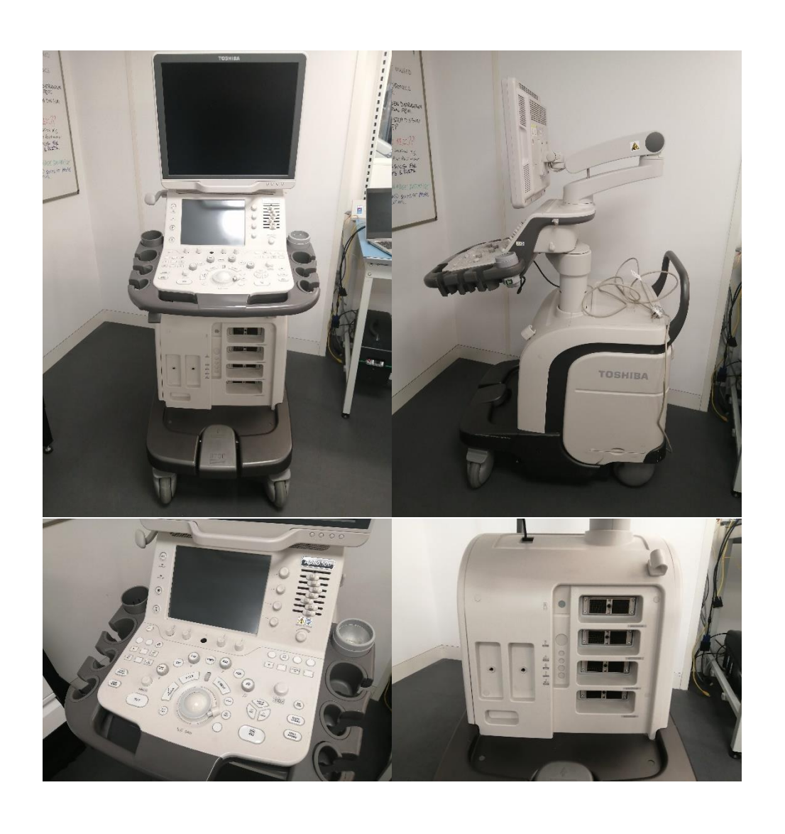
Section 3 – Electrical Safety Test